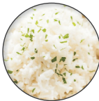
Steamed Fluffy Rice