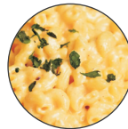
Macaroni and Cheese