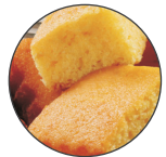
Golden Sweet Cornbread