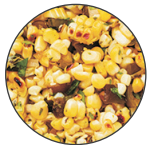
Roasted Pablano Corn