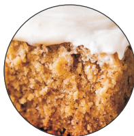
Banana Nut Cake