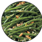
Garlic Green Beans