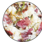
Garlic Red Skin Potatoes