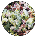
Broccoli Medley Salad